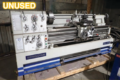
2022 BIRMINGHAM YCL-2060