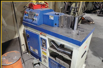
2013 SUNRISE HBM-45