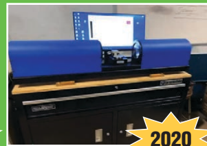
2020 Oasis COREX2-12096 Optical Inspection System