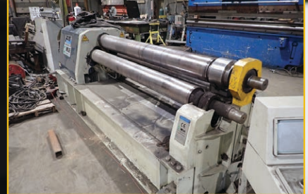
2012 IMCAR SIHR 6/3