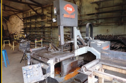
2012 MARVEL 2125M