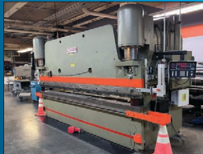
Pacific K-200-12 Hydraulic Press Brake