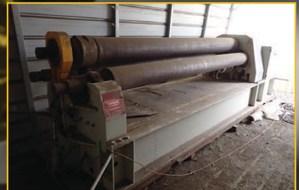
2012 IMCAR SIHR-10