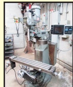
BRIDGEPORT EZ TRAK CNC BED MILL

LIVE ONLINE BIDDING ONLY (NO ONSITE BIDDING): YOU MUST REGISTER IN ADVANCE FOR ONLINE BIDDING AT THIS AUCTION. Go to www.pmi-auction.com and click on BidSpotter or proxibid on our calendar page for this auction sale.