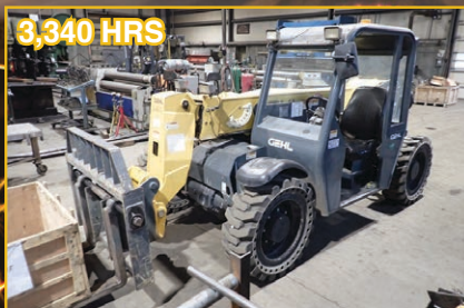
2013 GEHL RS5-19