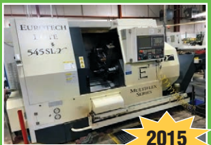
2015 Eurotech Elite B545-YS CNC Turning Center