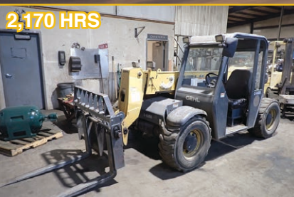
2017 GEHL RS5-19