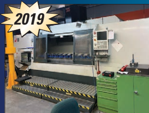
Haas VF-10/40 CNC VMC