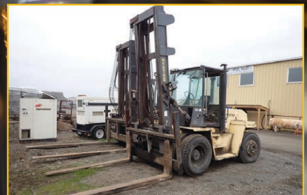
2000 HYSTER H190XL

James G. Murphy Co. - Murphyauction.com - 425.486.1246