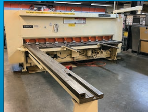
Cincinnati Hydraulic Power Squaring Shear